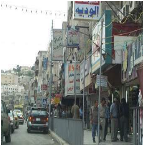
Down Town Amman