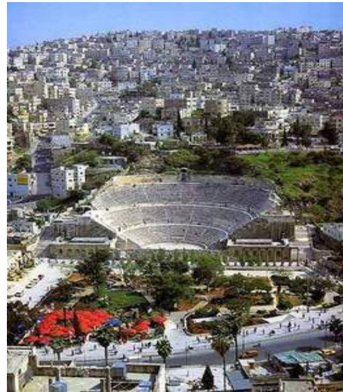
The Roman Amphitheatre